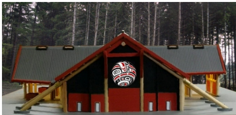
Model - West Side

We have had the honor of working with the Nisqually Tribe on a new multi-denominational Christian church building. They chose BPH Architects because they felt we would listen to them and be responsive to their needs.