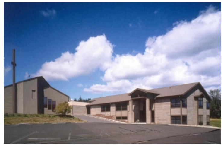
Exterior View At Christian Education Addition