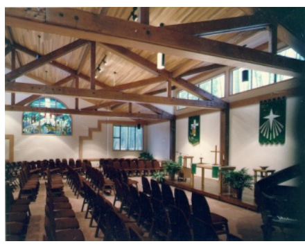
Interior View At Centrum