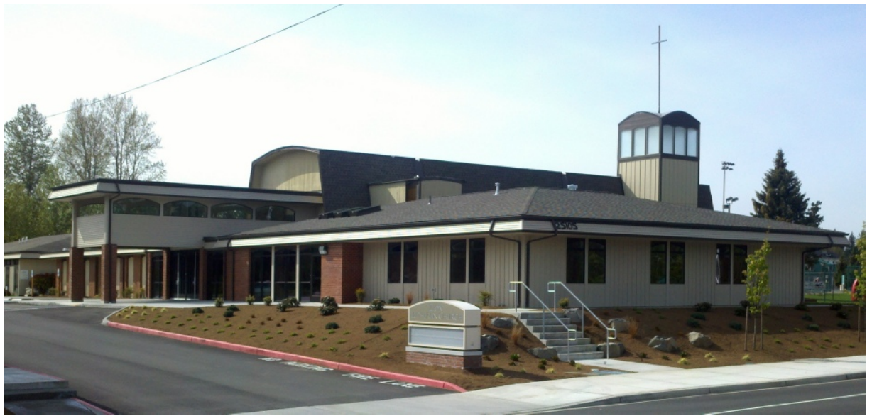
Exterior View from Street