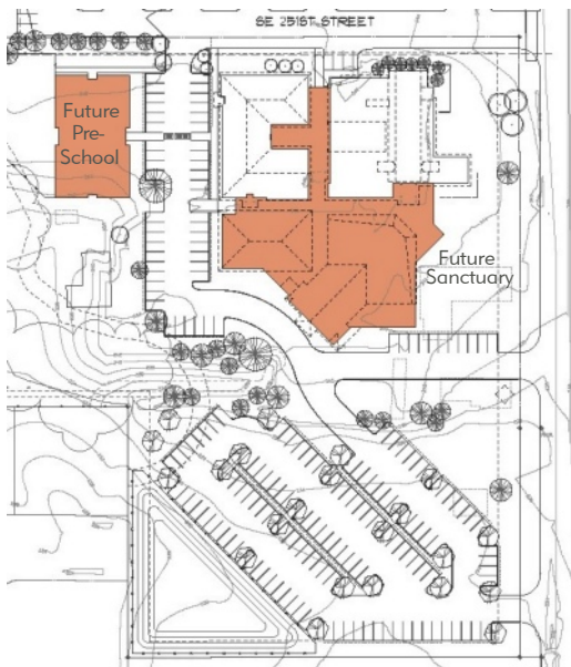
Master Site Plan

The first phase of our master plan for Zion Lutheran consisted of 3350 SF in additions, including new covered drop-off, expanded narthex and offices, and a shared conference room. We also expanded the existing kitchen and retrofitted it with commercial equipment.