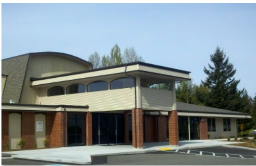
New Covered Entry