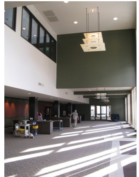
Interior View of Foyer