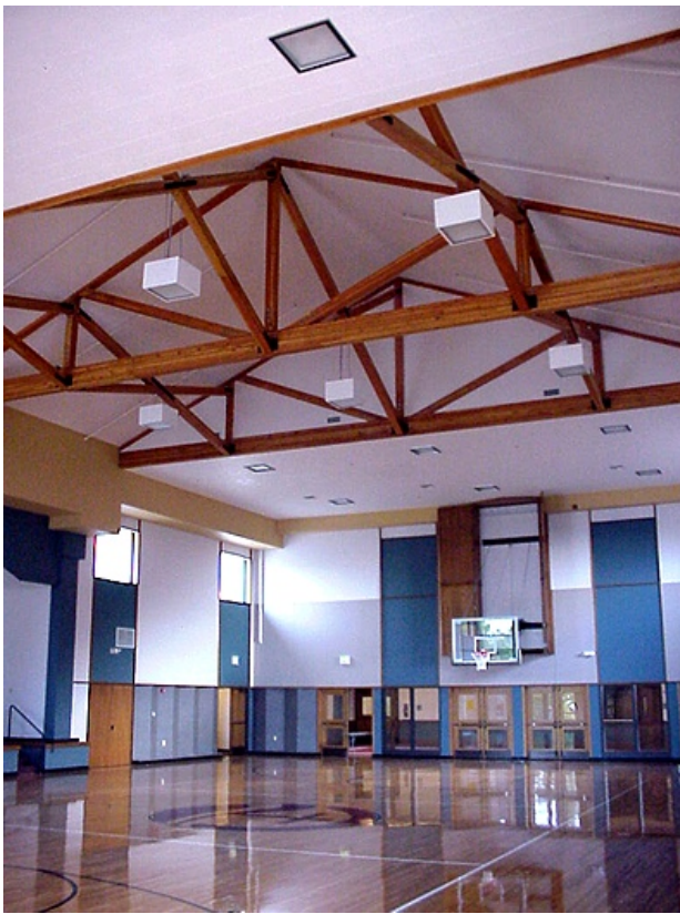
Multi-Purpose Room In Sports Layout