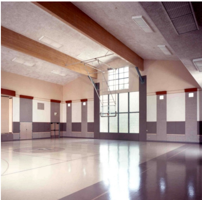
Multi-Use Room Interior

A 9,000-square foot free-standing, multi-use facility with a fellowship hall / gymnasium, meeting room, large kitchen, stage, storage space and restrooms.