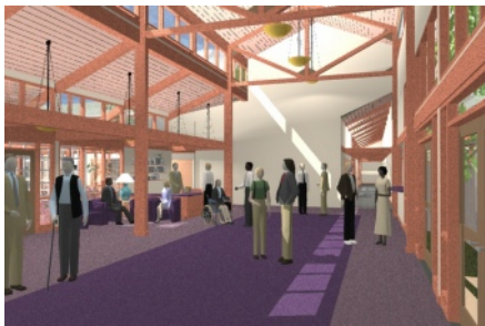
Interior Rendering of Foyer

This addition/modernization project includes tying together two separate existing buildings, a sanctuary and a multi-purpose building. Included in the addition are offices, foyer, nursery, restrooms, a music rehearsal room and classrooms.