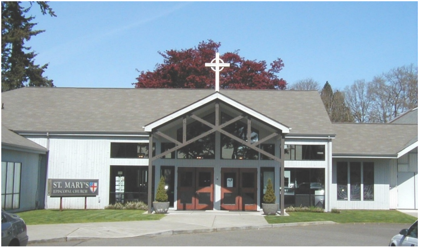
Exterior View At Main Entry