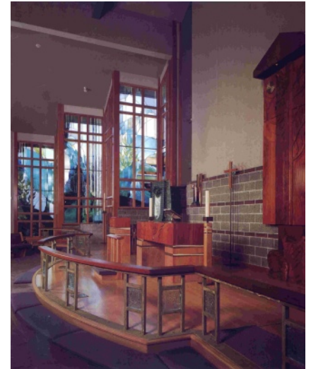
Stained Glass In Sanctuary