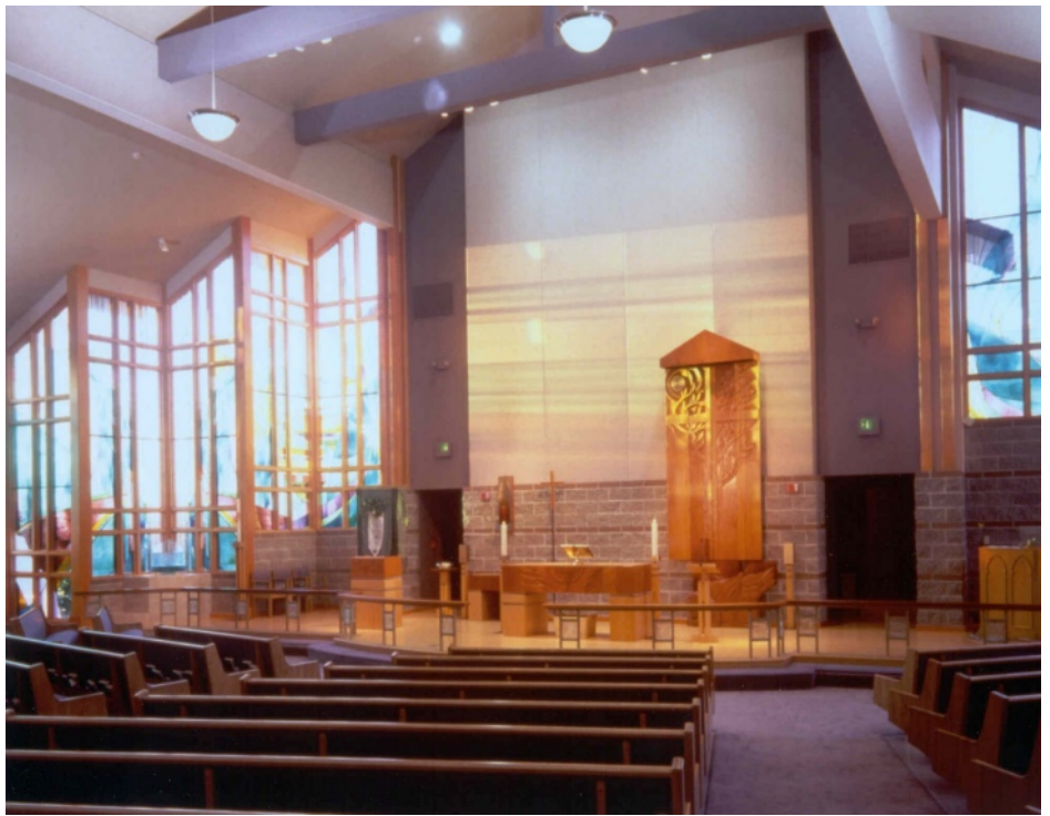
Interior View Towards Altar and Windows

This project includes a new 330-seat sanctuary, extensions of the foyer, accessible restrooms, and renovation of the existing worship space into a multi-purpose foyer / fellowship hall. Other renovations included changing a small fellowship hall into an administrative suite and adding storage space. Future projects include a new two-story classroom wing, and changing existing office space into classrooms.