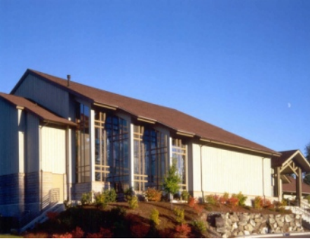
Exterior View at Sanctuary Addition