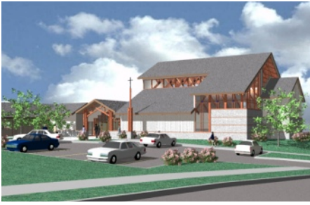
Rendering at Entrance