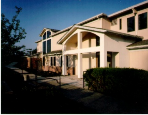
Exterior Perspective of Entrance