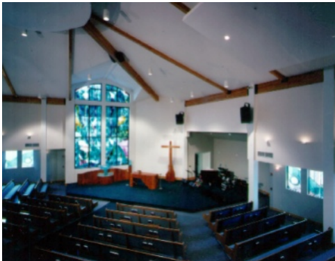
Interior View of Sanctuary

This project included a 21,000-square foot sanctuary, narthex, classroom addition and the renovation of the existing 27,000-square foot building. We converted the existing sanctuary into classrooms and an office suite by adding a new floor. By using an elevator and ramps, we made the total building accessible.