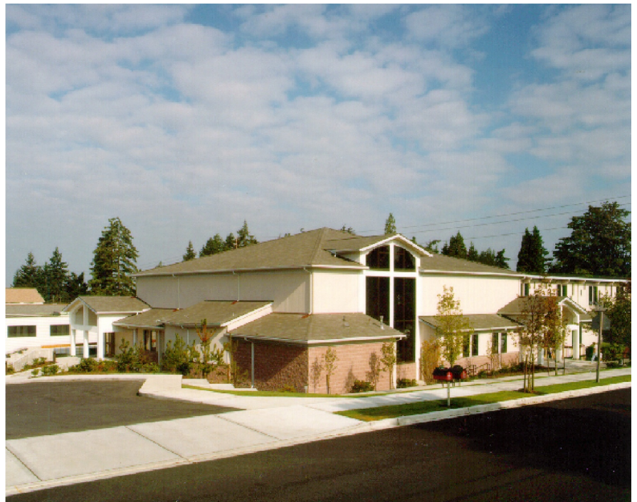
Exterior View From Street