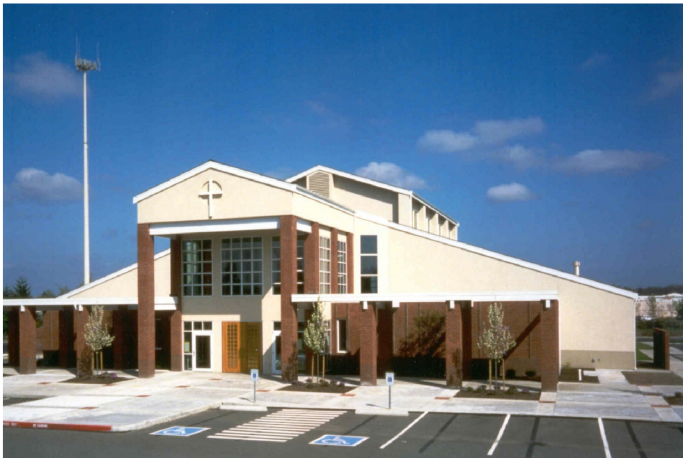
View of Entrance