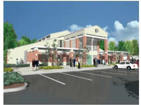
CADD Exterior Rendering