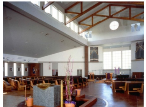
Interior of Sanctuary

This new free-standing worship facility encloses 11,200 square feet of space and accommodates 900 people for worship. Construction allows future operable walls that can be installed to create two large meeting spaces for classrooms or parish community use. The new project is located on an existing campus used by the parish for its school, administration and present worship needs.