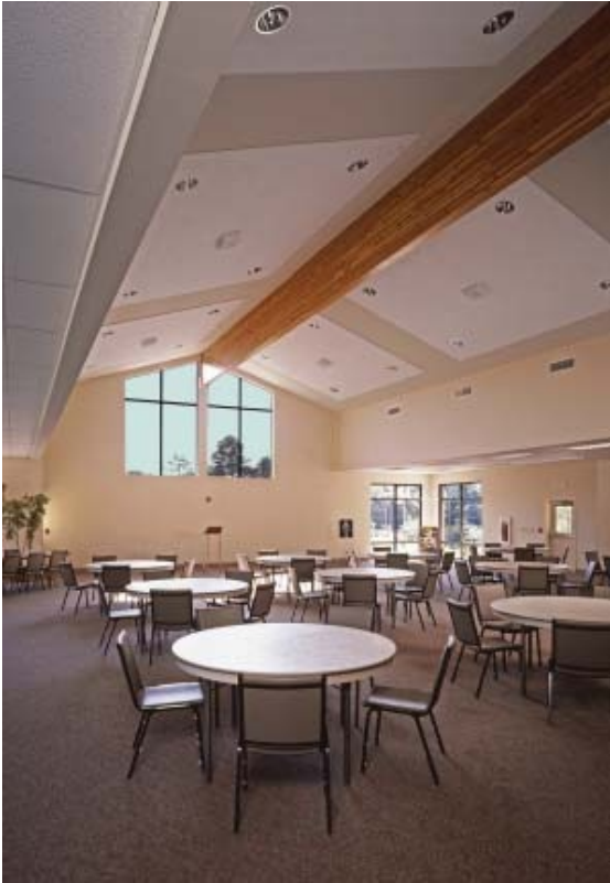
Parish Hall Interior