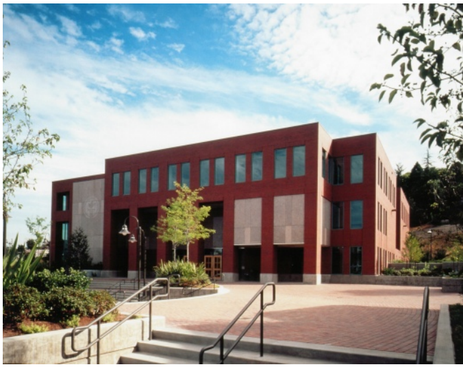
Exterior View @ Entry