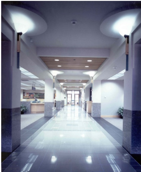
Interior View From Lobby

SPU's main campus library contains 60,000 square feet of floor area. We did the interior design for the building right down to the light fixtures to give a cohesive design statement. The floor-to-floor height was kept down to save cost, but we maintained the impression of height inside by limiting mechanical cross-over locations and using reflective flooring. The building was sited to connect the upper and lower campus functions, and the project also includes a new central plaza that serves as a focal point to the upper campus.