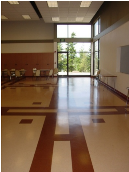
Multipurpose Room Interior

This is the first phase of a master plan we did for Silverdale Lutheran. The free-standing addition includes a 2900 SF multipurpose room and 8 classrooms. The building is approximately 8800 SF.