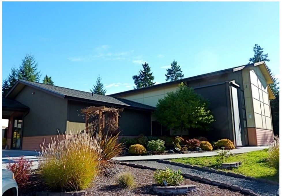
Exterior View of Addition