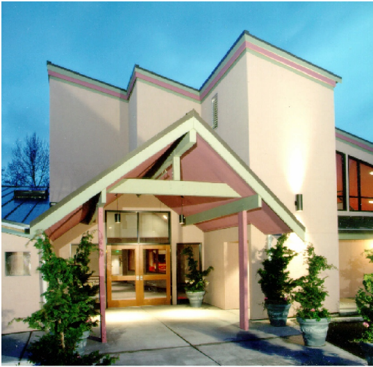
Exterior View of Entrance