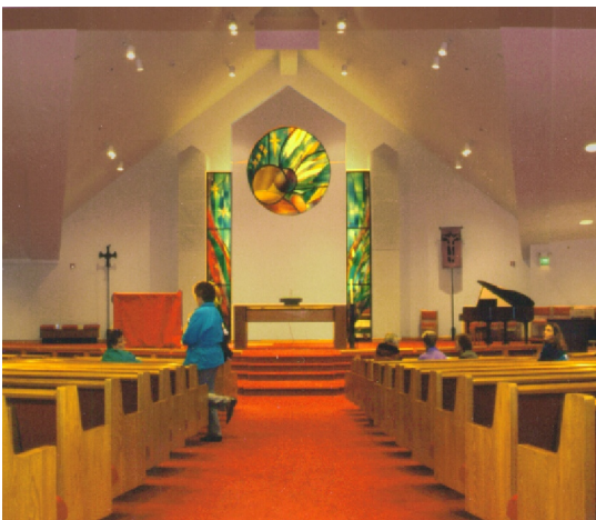
Interior View of Sanctuary