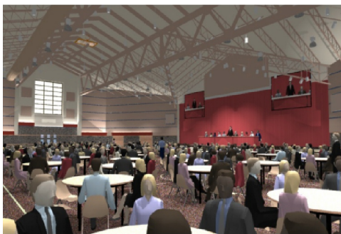
Multi-Purpose Room In Fellowship Layout