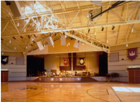
Multi-Purpose Room In Sports Layout