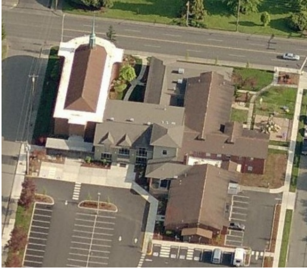
Bird's Eye Photo

This project adds a 12,850 square foot addition to the existing building. It connects two existing buildings together, and makes the second floor accessible with the addition of a new elevator. The upper level contains adult classrooms, and the lower level contains a fireside room, administrative suite, and a large foyer/gathering space.