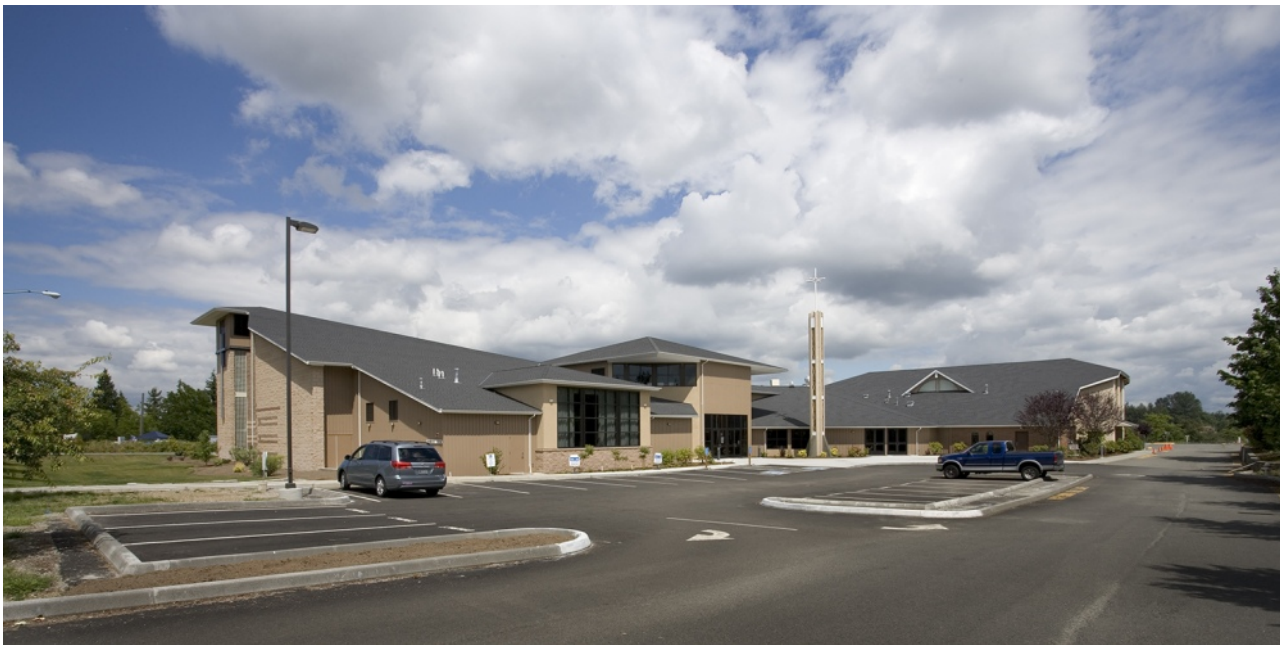
Exterior View from Street