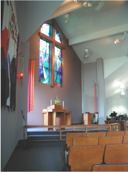
View at Sanctuary

The new 300-seat sanctuary has an overflow "mini fellowship hall" which opens into the sanctuary and forms a large multi-purpose room for large services and events. Other features include a kitchen to support the fellowship hall, nursery and classroom space. Existing buildings on the site provide a temporary home for office and additional classroom functions. Our master plan includes Phase II plans for a future multi-purpose education, fellowship/gymnasium building.