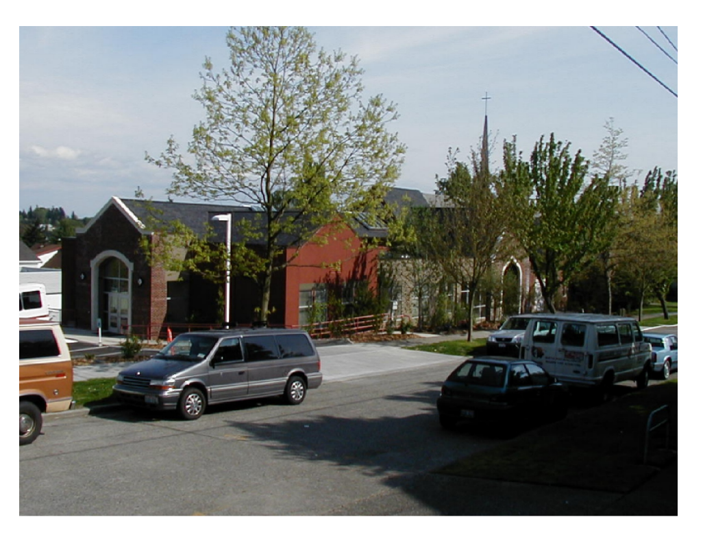
Exterior View At Addition Corner

Winner of the Associated Builders & Contractors Of Western Washington's 2004 Excellence In Construction award for Tenant Improvement/Renovation.