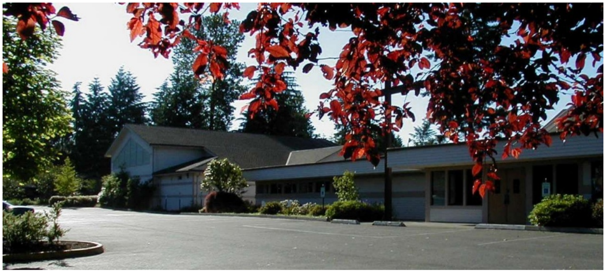
Exterior View from Parking Lot