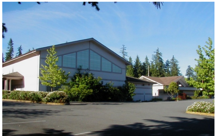
Exterior View of the Addition

We designed a freestanding 7,800 square foot multi-purpose building, separate from the original building to avoid having to upgrade the existing building to current code. The project includes a gym/fellowship hall, classrooms, kitchen, restrooms, storage, and foyer. The new building ties in visually with the existing church by using similar roof pitch, clear story windows, and horizontal lines.