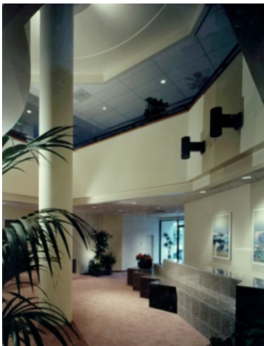
Interior View Of Lobby