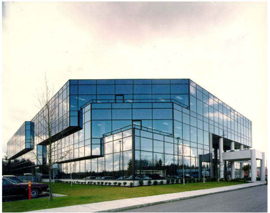
Exterior View of Main Entrance

The design created a variety of flexible floor plates, with a number of corner offices and two roof gardens.