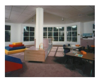
Phase I Classroom

Simplicity, expansion flexibility, and a nontraditional church image were the chief design goals that were set in the design of this large church building.