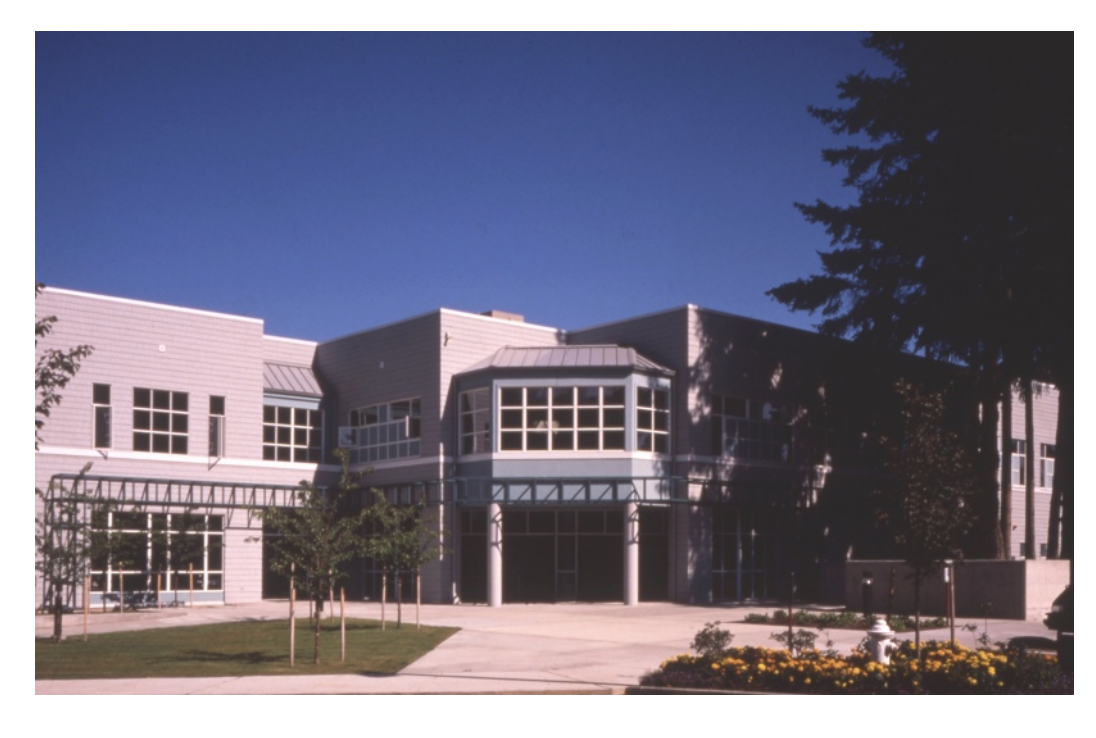
Exterior View at Entrance