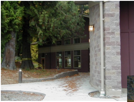
Exterior View of Main Entry