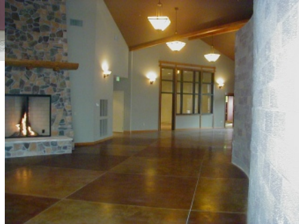
Interior View of Foyer