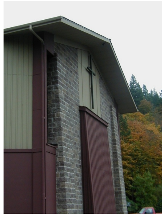
Exterior Detail View