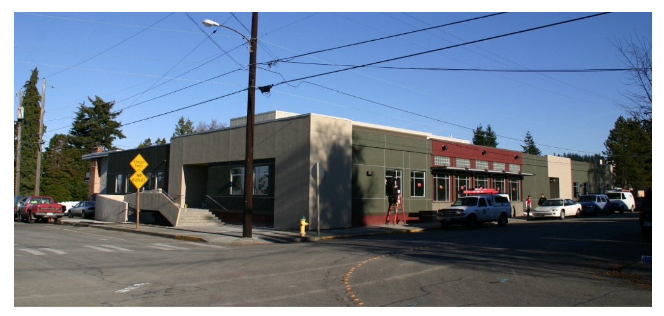
Exterior View from Street