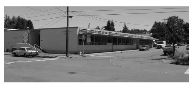
Existing building before remodel