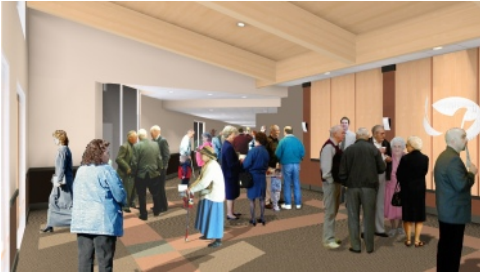
Computer Rendering of Foyer