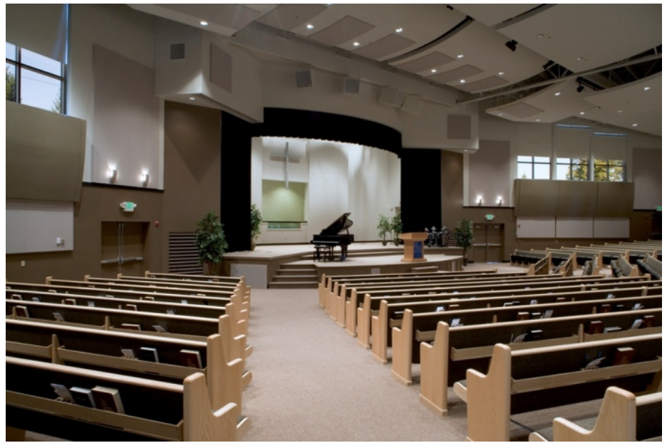
Interior View of Sanctuary