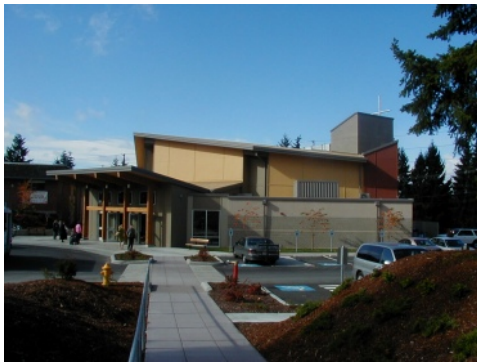
Exterior View of Main Entry