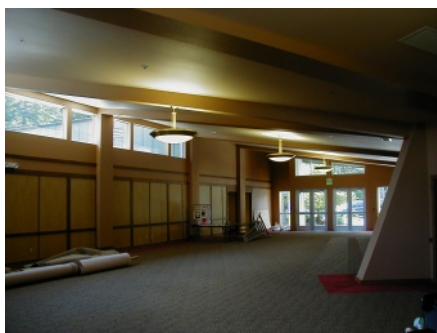
Interior View at Foyer