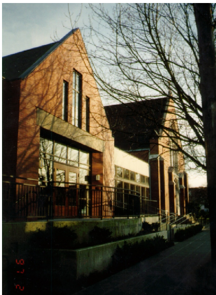
View at the Entry.