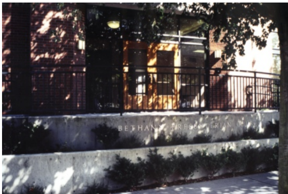
Streetscape at the Entry.

This project added a 6,700-square foot fellowship hall to an existing historic landmark church on Queen Anne Hill in Seattle. Portions of the existing 12,800-square foot church building were remodeled including converting the existing fellowship hall into classrooms. A 2800-square foot residence was given a fresh look and was converted to church offices connected to the new foyer.