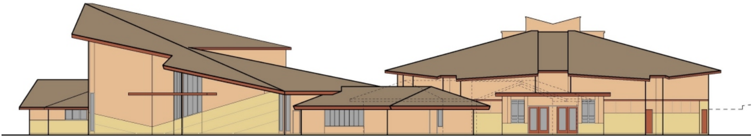
Front Master Plan Elevation