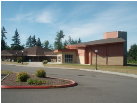
Exterior Photo of Main Entry