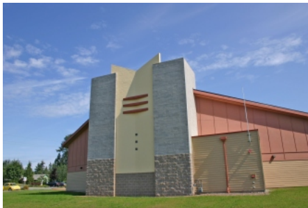
Exterior Photo of Tower

The second phase of the master plan included free-standing 300-seat sanctuary and classroom buildings, resulting in a 3 building campus that can be connected in the future. The design of the buildings was inspired by the original church building by Milton Stricker, an architect strongly influenced by Frank Lloyd Wright.