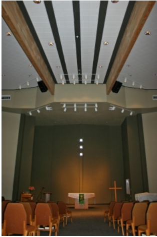
Interior Photo of Sanctuary

Prompted by a purchase offer on their valuable commercial property, the church decided to relocate to a new site. We helped them with a master plan for the new property, including a Phase I that relocated the existing building. The tractor used to move the building was actually located inside the structure so it looked like the church was driving down the street at 3 AM. Talk about a “church on the move”.